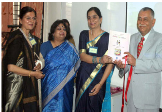
Advisor, Chandigarh Administration on the Book Release Function at the institute