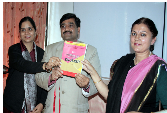
Home Secretary, Chandigarh Administration on the Book Release Function at the institute