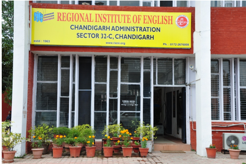
Regional Institute of English, Chandigarh http://www.rieni.org

Annual Report of the Regional Institute of English, Chandigarh for the year 1 st April 2010- 30 th March 2011. The Institute caters to the ELT needs of Punjab, Haryana, J&K, Himachal Pradesh and Chandigarh and functions within the purview of Chandigarh Administration.